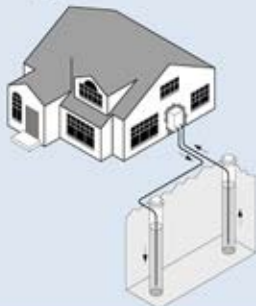
Open Loop Systems